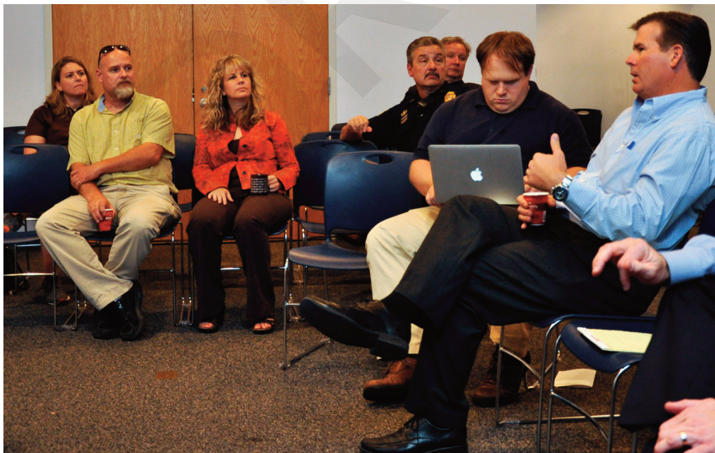
PPI Committee Meeting, October 22, 2015.

The PPI Committee has convened twice to work on the PPI formally, in addition to informal reviews of the PPI through the development phase. The two formal meetings were held on October 22, 2015 and March 14, 2016. The first meeting explained the PPI process and the role of the committee. The second meeting focused on current and future outreach projects and a review of the draft document. In addition, the PPI Committee has reviewed draft PPI documents on an on-going basis.