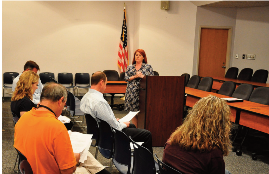
PPI Committee Meeting, March 14, 2016.